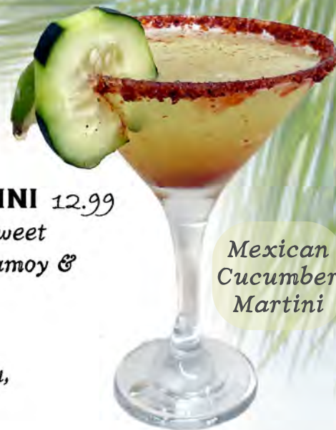
Mexican Cucumber Martini

Not valid for merchandise Cannot be combined with other discounts or specials